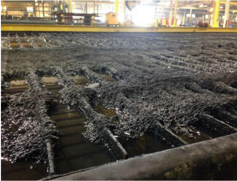
Water downdraft plasma table