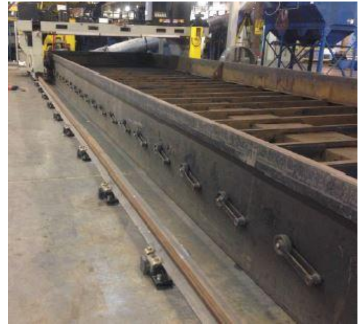
Replaced with air downdraft plasma table